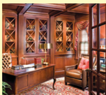
Case and Paine style homes