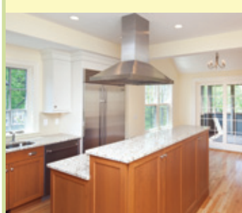
Merriam "A" Townhome