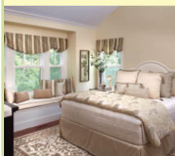
Danforth & Wellington style homes