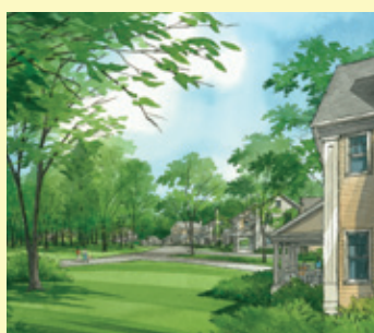
Phase IV "Hilltop" tours