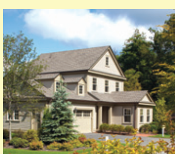
Blake style home