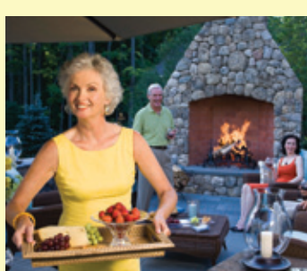
Meetinghouse - Refreshments on the Patio